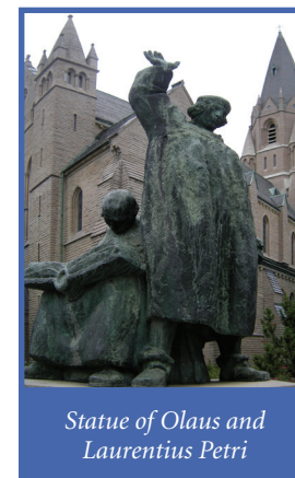
Statue of Olaus and Laurentius Petri

In Sweden , two brothers, Olavus and Laurentius Petri, spearheaded the Reformation. Both had studied theology with Luther in Wittenberg. They returned to Sweden around the same time King Gustav I Vasa was creating an independent nation. He made Olavus pastor of the city church in Stockholm, where he translated the New Testament into Swedish, created a catechism, published an order of worship, and provided a Swedish hymnal. Meanwhile his younger brother, Laurentius, was made the first Lutheran archbishop of Sweden; he and Olavus jointly produced a complete Bible in Swedish.