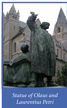
Statue of Olaus and Laurentius Petri

In Sweden , two brothers, Olavus and Laurentius Petri, spearheaded the Reformation. Both had studied theology with Luther in Wittenberg. They returned to Sweden around the same time King Gustav I Vasa was creating an independent nation. He made Olavus pastor of the city church in Stockholm, where he translated the New Testament into Swedish, created a catechism, published an order of worship, and provided a Swedish hymnal. Meanwhile his younger brother, Laurentius, was made the first Lutheran archbishop of Sweden; he and Olavus jointly produced a complete Bible in Swedish.