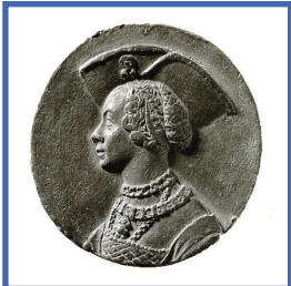
Argula von Grumbach

“I am prepared to lose everything, even life or limb. May God stand by me.” So wrote Argula von Grumbach (1492–1563/68?) from Bavaria, who found Martin Luther’s message of Christian freedom and equality empowering. This noble woman challenged an entire Catholic university in Ingolstadt in defense of Lutheran faith and a student persecuted for “Lutheran heresy.” This